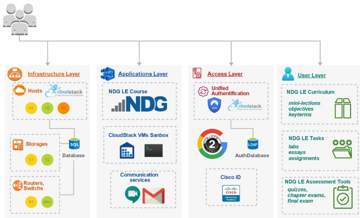
Figure 1: The architecture of the laboratory CL-OS

The CL-OS laboratory model is presented as a 4-layer structure. Infrastructure, application, access, and user layers implement technical and educational requirements for the cloud laboratory. This laboratory corresponds to the cloud concept: it is fully automated, inexpensive and scalable in design; Apache Cloudstack or Proxmox VE cloud platforms architecture provides simultaneous work of students with Linux VM from 50 to 100 students [51]. The maximum number of VMs will be in the case of the command-line mode of VMs running. If students need to work with a graphical interface, the number of VM will be approximately 2 times less.